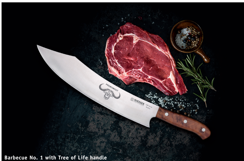
Barbecue No. 1 with Tree of Life handle