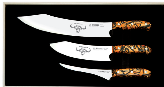
1999 3 so, handle: Spicy Orange