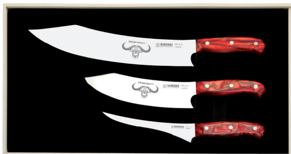
1999 3 rd, handle: Red Diamond