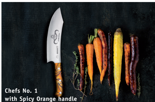
Chefs No. 1 with Spicy Orange handle