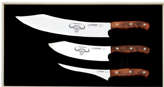
1999 3 tol, handle: Tree of Life, Thuja