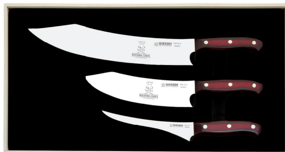
1999 3 rc, handle: Rocking Chefs