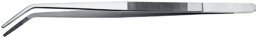
9514 s 17cm | 6 3/4" 27cm | 10 1/2" 37cm | 14 1/2" Tweezer with spoon