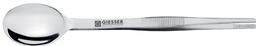
9514 s 17cm | 6 3/4" 27cm | 10 1/2" 37cm | 14 1/2" Tweezer with spoon