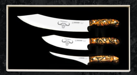
1999 3 SO | SET OF 3 Spicy Orange blade lengths: 17, 20, 30 cm 11¾, 7¾, 6¾ inches