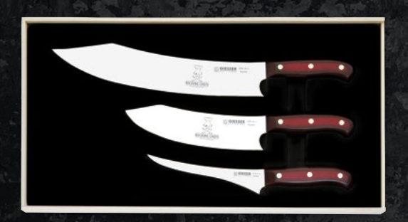
1999 3 RC | SET OF 3 Rocking Chefs, Micarta blade lengths: 17, 20, 30 cm 11¾, 7¾, 6¾ inches