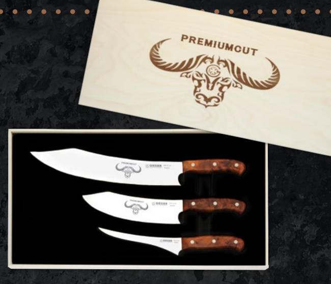
1999 3 TOL | SET OF 3 Tree of Life, Thuja blade lengths: 17, 20, 30 cm 11¾, 7¾, 6¾ inches