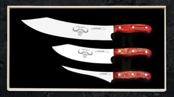
1999 3 RD | SET OF 3 Red Diamond blade lengths: 17, 20, 30 cm 11¾, 7¾, 6¾ inches