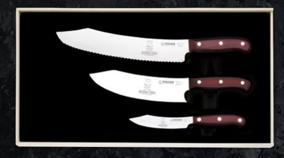
1996 3 | SET OF 3 contains: 1930 w 25, 1900 20, 1920 10 | version shown: Rocking Chefs, Micarta blade lengths: 25, 20, 10 cm | 9¾, 7¾, 4 inches